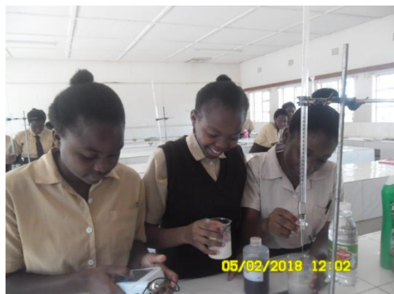
Figure 1: Pupils Happily Explore Acids and Bases

Overall, the results above showed significantly better performance of the class that used ( n=30 ) the REACT strategy plus SDG6 learning objectives than the class that served as the control class. The gains from pre-test to post-test were significant in the REACT experimental group and not significant in the control group. The REACT teaching strategy had a greater positive impact on the contextualised teaching and learning of acids, bases and salts in real contexts of the SDGs. Noteworthy in the study was the fact the REACT strategy made learning joyous (Photograph 1) while remaining engaging (Photograph 2).