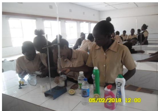
Figure 2: Pupils Performing an Experiment Using Different House Hold Products