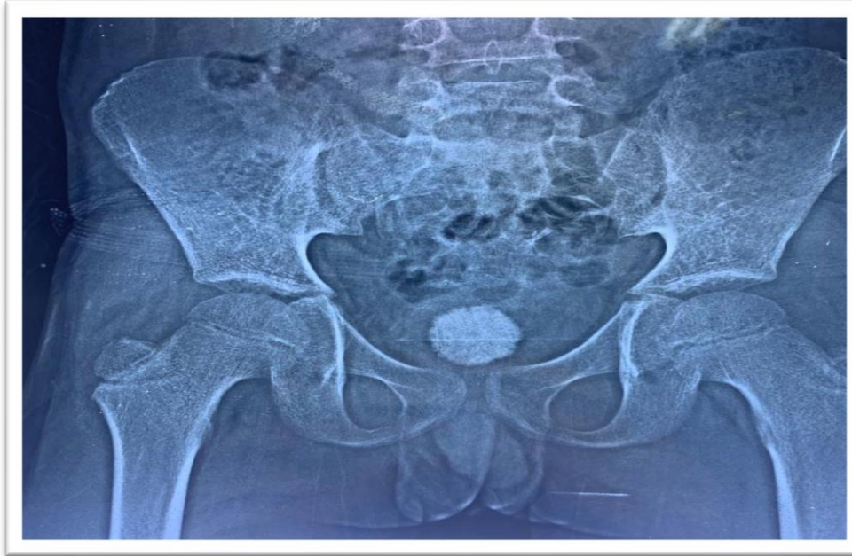
Figure 1: X-ray KUB showing bladder stone

surgical complications such as hematuria, infection/sepsis, and minor mucosal injury. According to figure 3, uric acid stones accounted for the vast majority of stones (86.70%), followed by calcium (10.0%) and mixed stones (3.30%).