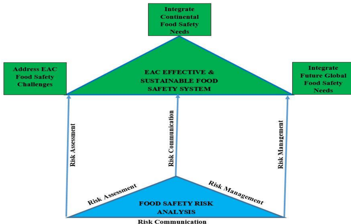
Figure 2: The Foundational Role of Food Safety Risk Analysis for the EAC Food Safety System

The implementation of a risk analysis framework in the EAC food safety system will help to establish minimum standards and risk-based systems at all levels (international, national and business). That is the first step to ensure cost-effectiveness with available resources to uniformly lift compliance, and improve food safety outcomes in the region (Kang’ethe et al., 2021; Oloo et al., 2018; Thompson, 2021). That will be reached by prioritizing the riskiest food safety hazards since not all food safety hazards pose the same risks (FAO & WHO, 2005; Mahmoud, 2019). It will then lead to the establishment of detailed country- and region-specific useful data for risk and FBD burden assessment along with determining public health priorities (Mutua, Masanja, et al. , 2021), and food safety research priorities (Godefroy et al. , 2019). As result, critical risks will be efficiently eliminated with finite resources while allowing farmers to produce, without prejudice, acceptably safe products that enter the market at prices consumers can afford, thus boosting public health and protecting trade (FAO, 2019; Godefroy et al. , 2019; Humphrey, 2017; Thompson, 2021).