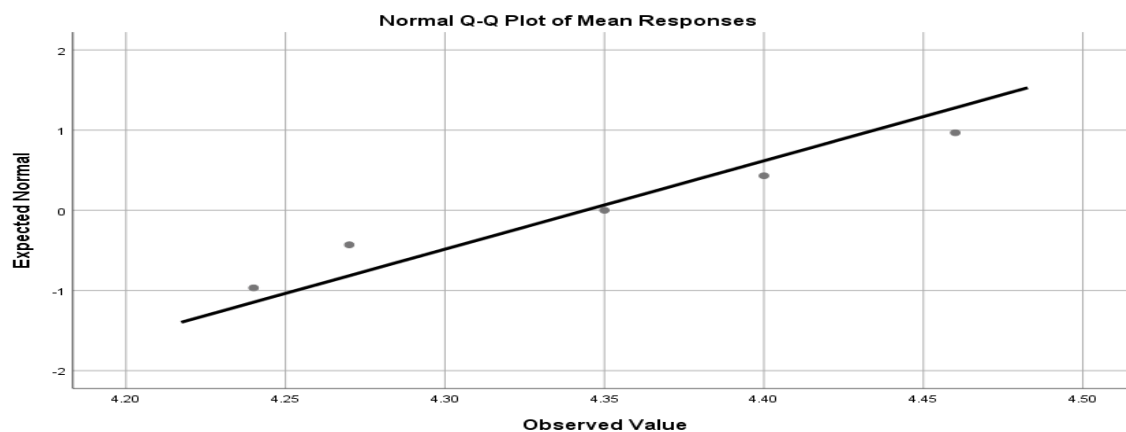
Figure 3: The graph of normality for hypothesis 3

As provided in table 12 above, the t-statistic value of 33.127 with an associated probability value of 0.000 < 0.05 indicates that COVID-19 exerts statistically connected with funding risk premium placed by capital providers in Lagos State, Nigeria. The normality test estimate [with Sk > 0 , K < 3 , Prob (K-S stat.) = 0.200 > 0.05 , Prob (S-W stat.) = 0.795 > 0.05 ] indicates that the data series is skewed to the right and without excess kurtosis. However, the K-S and W-S statistics confirmed that the data series are normally distributed and statistically different from zero.