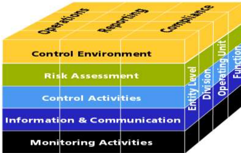
Figure 2: Components of Internal Controls