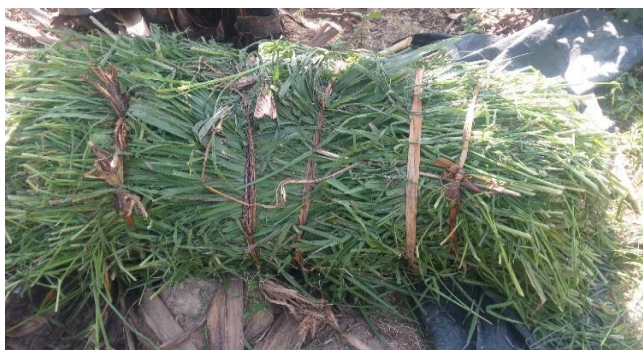
Figure 5: Napier grass