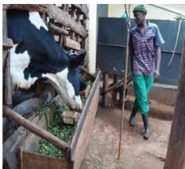
Figure 3: Cattle feeding on crop residues