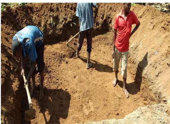
Figure 9: Labour at work digging a hole to make silage

The study findings revealed that average cost of labour is also one of the significant socioeconomic factors that influence the level of supplementary feeding adoption. The regression 'R' indicates that there is a significant relationship ( R=0.318 ) between average cost of labour and level of supplementary feeding adoption. The coefficient of determination ' R^2 ' also indicates a significant value ( R^2=0.101 ) which implies that average cost of labour explains only 10.1% of the variations in level of supplementary feeding. The F-statistic ( F=20.086 ), beta value ( \beta=.318 ) and t-value ( t=4.482 ) are very big and p-value less than the significance ( \text{sig.}<0.05 ) which implies that average cost of labour has a significant influence on level of supplementary feeding. The observed frequencies indicate that majority of the smallholder farmers incurred more than Ugx 100,000 as the cost of labour. This implies that those who afford this cost of labour are likely to adopt supplementary feeding while those who do not afford the cost of labour are not likely to adopt supplementary feeds. Observations during data collection revealed that preparation process of some feeds such as Hay and Silage requires a lot of labour to do the chopping of grass, digging silage holes, constructing houses among others as shown in the pictures below;