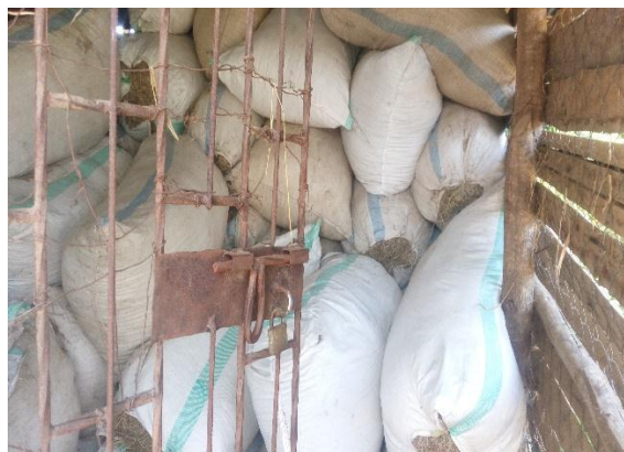
Figure 7: Stock of hay

The study findings revealed that average cost of supplementary feeds is also one of the significant socioeconomic factors that influence the level of supplementary feeding adoption. The regression 'R' indicates that there is a significant relationship ( R=0.386 ) between average cost of supplementary feeds and level of supplementary feeding adoption. The coefficient of determination ' R^2 ' also indicates a significant value ( R^2=0.146 ) which implies that average cost of supplementary feeding explains only 14.6% of the variations in level of supplementary feeding. The F-statistic ( F=30.457 ), beta value ( \beta=.382 ) and t-value ( t=5.519 ) are very big and p-value is less than the significance ( \text{sig.} < 0.05 ) which implies that average cost of supplementary feeds has a highly significant influence on level of supplementary feeding. The observed frequencies indicate that majority of the smallholder farmers incurred a cost of 500-1000 and above 1000 to purchase a kilogram of supplementary feeds to give to cattle. This implies that those who afford this cost are likely to adopt supplementary feeding while those who do not afford are not likely to use supplementary feeds. During observations by the researcher, it was revealed that farmers needed to stock huge sacks of hay to feed cattle and purchase machines to chop grass for making silage as shown in the figure below;