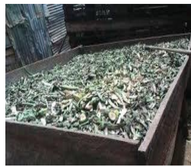
Figure 4: Banana peelings mixed with other crop residues