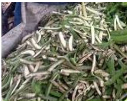
Figure 2: Banana peelings

The study also inquired about the major types of supplementary feeds applied. On this issue, majority 62 (38.5%) of the respondents reported that they applied banana peelings, 42 (26.1%) applied crop residues, 20 (12.4%) applied hay, 13 (8.1%) applied silage, 6 (3.2%) applied roughages while 18 (12.2%) applied other feeds like green leaf commodities, jackfruit residues, salt, sweet potato leaves and water.