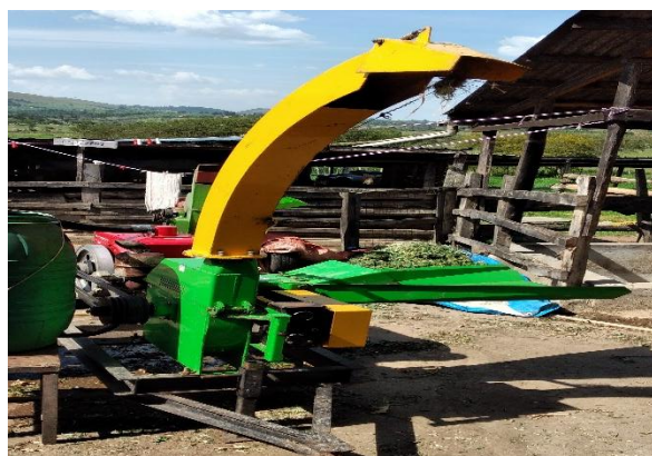
Figure 8: Machine to chop grass for making silage

However, most of the farmers (82.2%) reported that they did not have any external sources of funds used to purchase supplementary feeds or finance its operations rather than their own equity. This indicates that a lot of money is required to buy more than 1000 kgs of supplementary feeds that can feed the cattle for some good time.