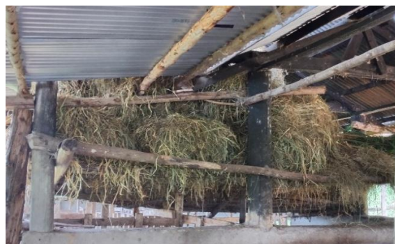
Figure 6: Hay for feeding cattle