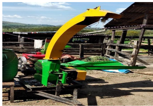
Figure 8: Machine to chop grass for making silage

However, most of the farmers (82.2%) reported that they did not have any external sources of funds used to purchase supplementary feeds or finance its operations rather than their own equity. This indicates that a lot of money is required to buy more than 1000 kgs of supplementary feeds that can feed the cattle for some good time.