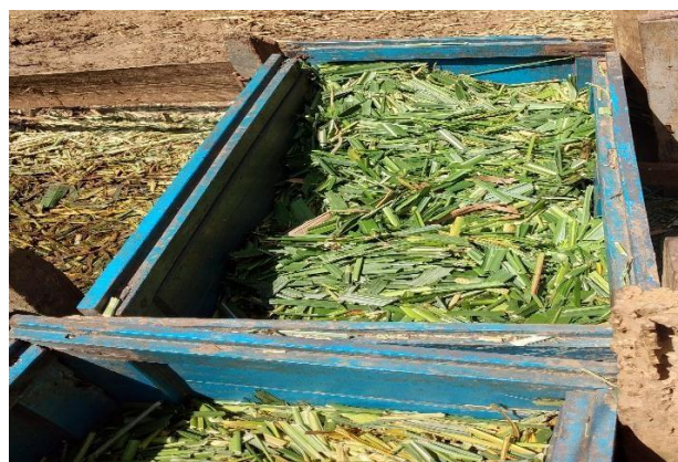
Figure 9: Labour at work digging a hole to Figure 4.10: Chopped grass make silage 5.0 Discussion, Conclusions and Recommendations 5.1 Discussion of Findings

The study findings revealed that over 80% of the smallholder cattle farmers in Mbarara district give their cattle supplementary feeds especially during a dry season when pasture is low in order to increase milk production. A similar study in Southwestern Uganda by Tibeziinda et al. , (2016) had found that only 29% provided supplementary feeds during dry season or conserved the excess pasture produced in the rainy season. Compared to the current findings, it is shown that the percentage of smallholder dairy farmers who adopt supplementary feeding has increased over the last five (5) years. This can be attributed to increased population that puts pressure on land, hence reducing the land available for grazing.