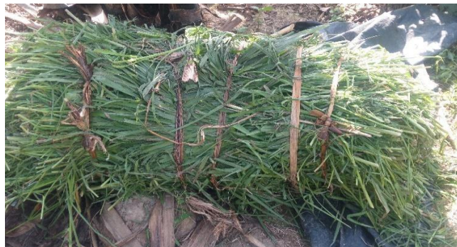
Figure 5: Napier grass